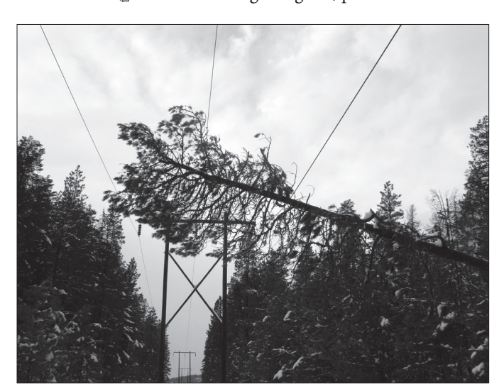
Lineworkers for Klickitat PUD untangled trees from the utility's Glenwood transmission lines after snow and ice in January brought down limbs and whole trees.

Step 1: Transmission towers and lines supply power to one or more transmission substations. Without these lines being energized, power cannot be